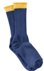
Cub Socks, Knee