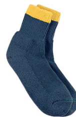
Cub Socks, Ankle