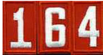
Pack Numerals Single patch version available from the Pack.

The Tiger book is available in bound form and spiral. The spiral version is triple the price. Covers are available.